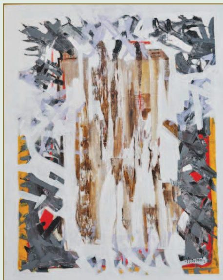
Houses Turned into Rags Acrylic- Collage 24X30 inch