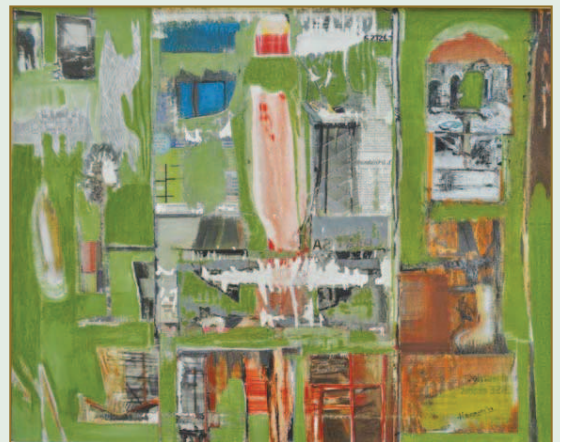
Nature Strikes Acrylic, Collage 24X30 inch