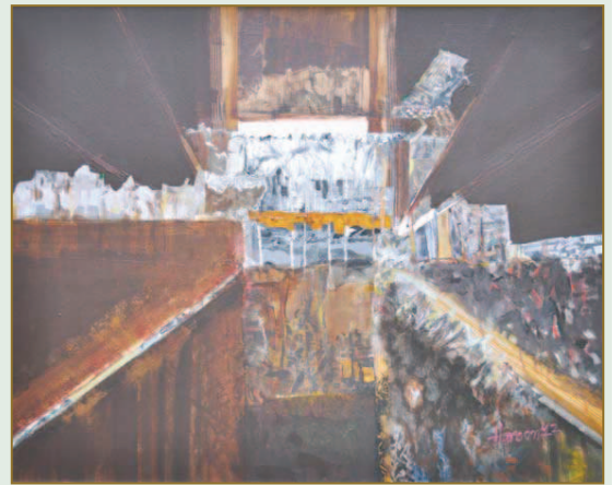
Reflection of Images