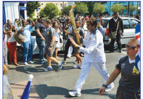
Ageing superstar Amitabh Bachchan carrying the Olympic torch in London on Thursday. India has sent its biggest contingent yet of 81 in 13 disciplines for the Games.

Continued on page 4 US, China to battle it out for top position...page 25.