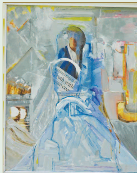
Invisible Through the Window's Frost Acry-Collage 20X24 inch