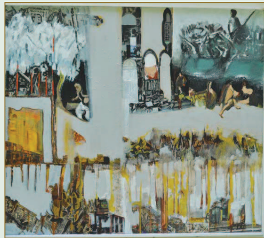
No Escape Acry-Collage 24X30 inch