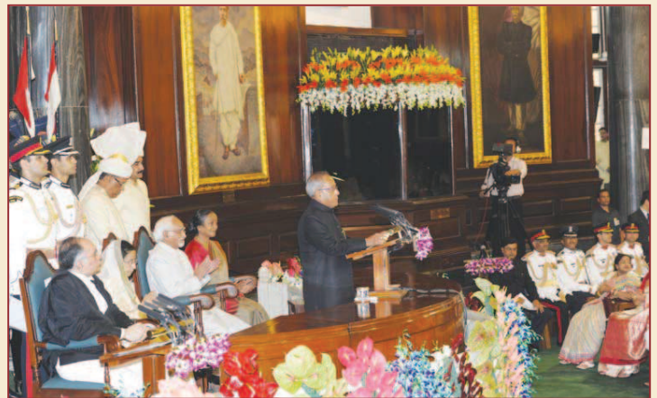
Maha Mahim Pranab Mukherjee, the 13th President of India, pledged to rise above partisan politics in his conduct of the highest office in the land.

Mukherjee was sworn in as President by Chief Justice S.H. Kapadia in New Delhi amid pomp and pageantry. The 76-year-old seasoned politician pledged to rise above partisan politics in his conduct of the highest office in the land.