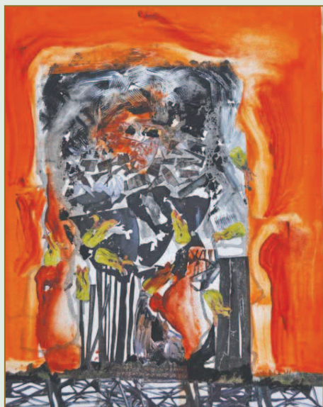
Blossoms in Disaster Acrylic Collage 22X28 inch

"Now, more at peace with himself, he has come back to painting. And has been for a while working