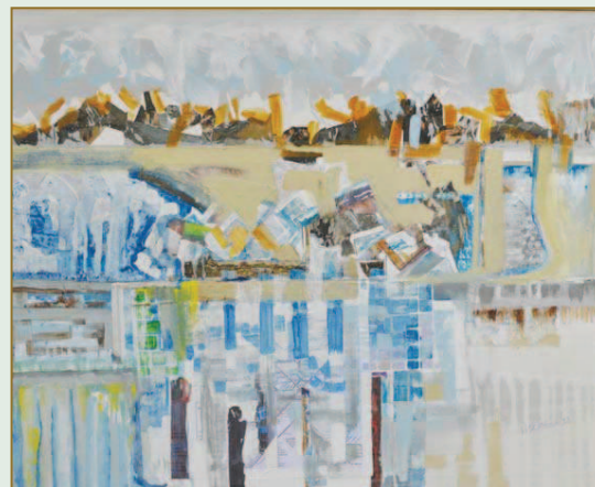
Crash Acrylic, Collage 22X28 inch