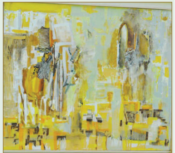
Harmony in Wall Painting Acry-Collage 20X24 inch